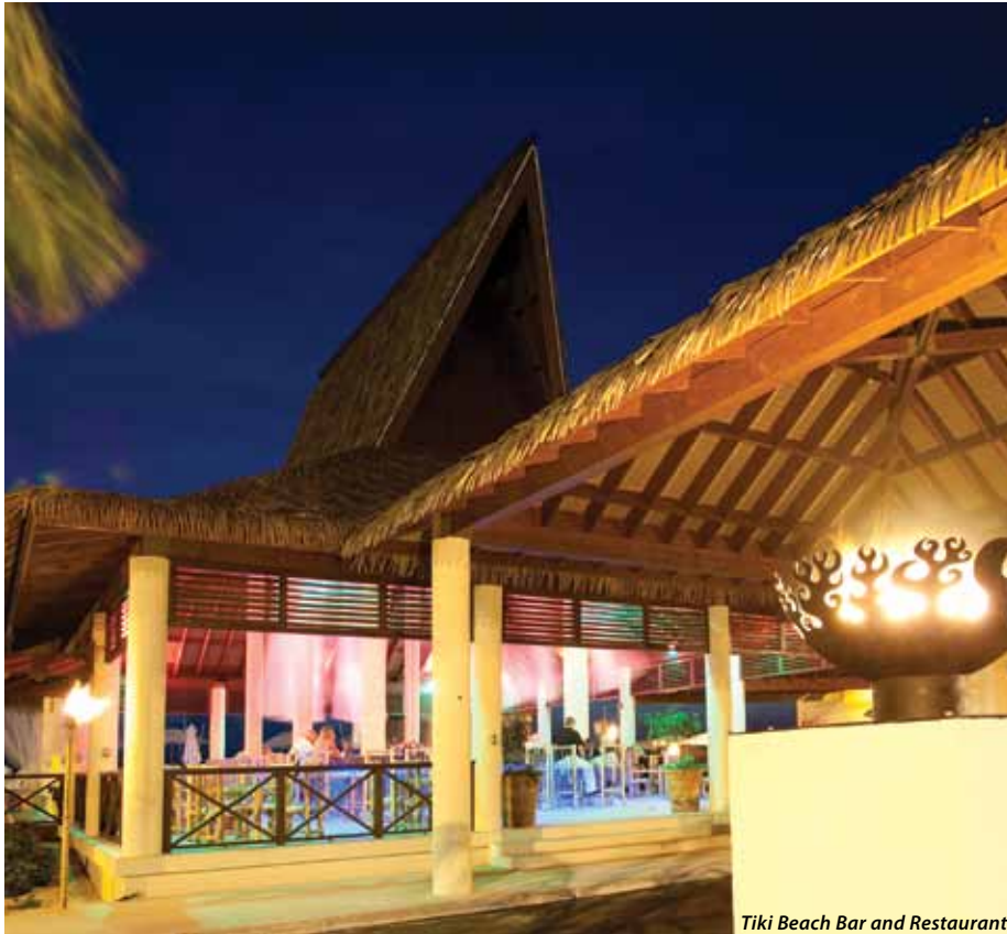
Tiki Beach Bar and Restaurant

ALL AROUND CAYMAN, YOU CAN SEE DOAK'S WORK FOR YOURSELF.