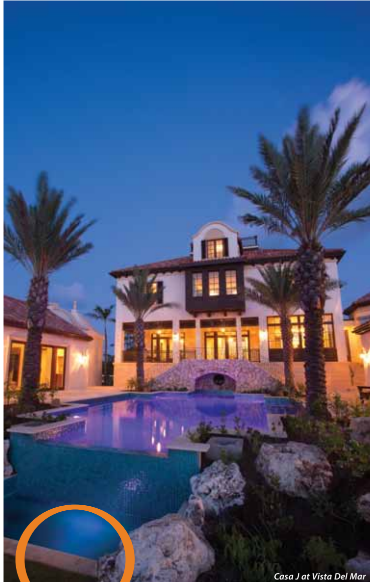
Casa J at Vista Del Mar