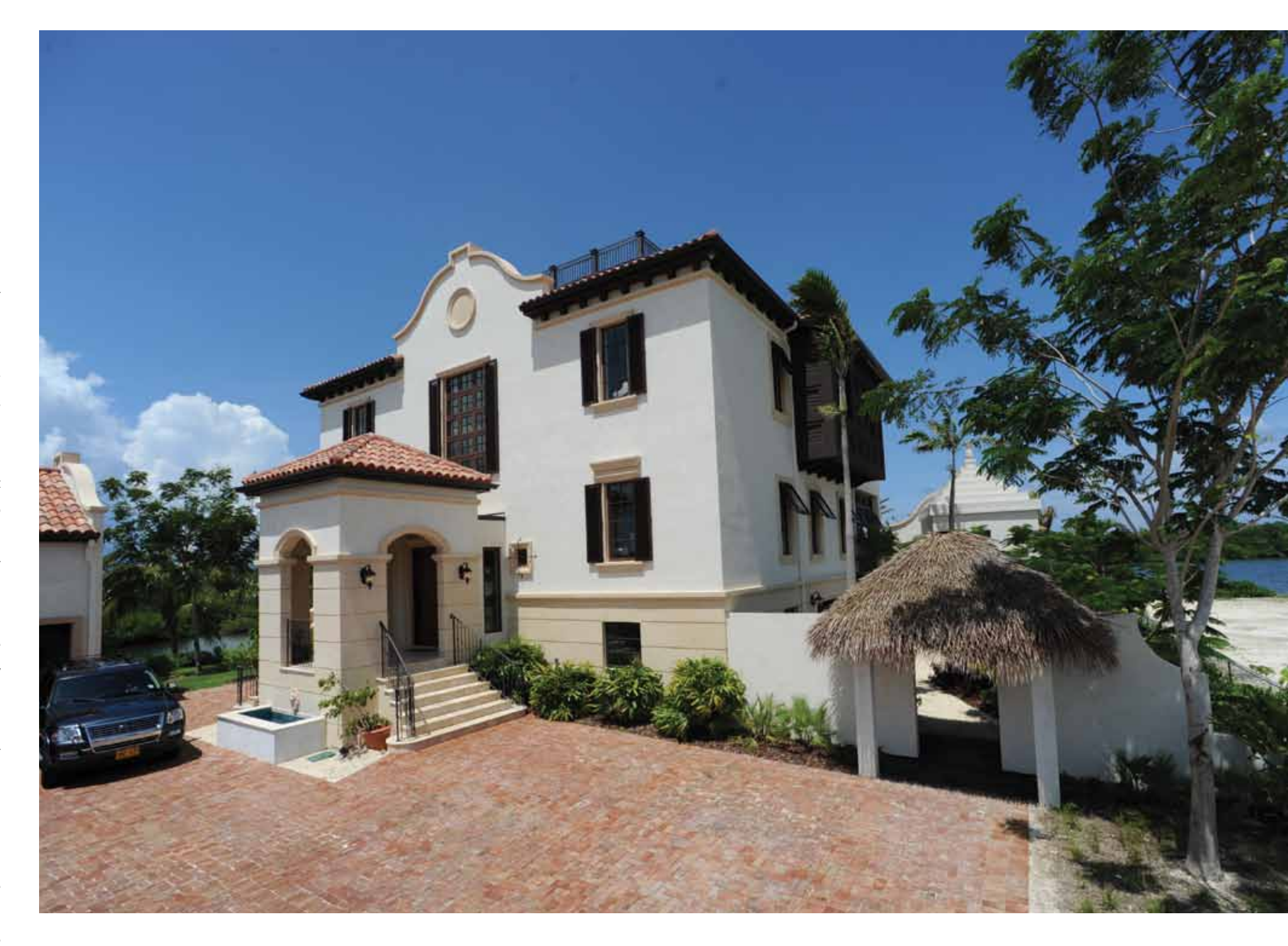
ABOVE LEFT Italian colouring and Bahama shutters LEFT Side view of house, palatial but welcoming ABOVE Entrance to Casa J, a modern West Indian great house

The look they have been striving to attain is "homely, relaxing and comfortable," according to Doak.