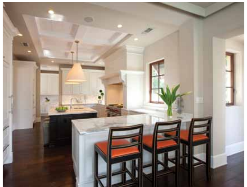
FAR LEFT Dining room with Indonesian wood table, a survivor of Hurricane Ivan LEFT Owners designed kitchen and pantry themselves BELOW Great Room has 12-foot high ceilings and large wooden beams